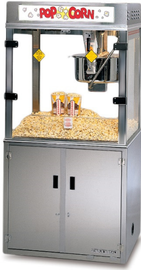
General image shown for reference.