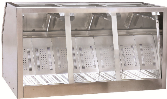
Customer Side (020 Series shown for general image reference only.)