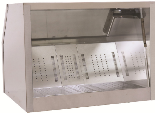
Customer Side (General image shown for reference only.)