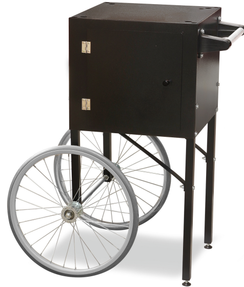
Rear View - Operator Side